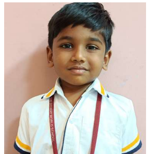
JAI KRISHH Y - K2 STRAWBERRY